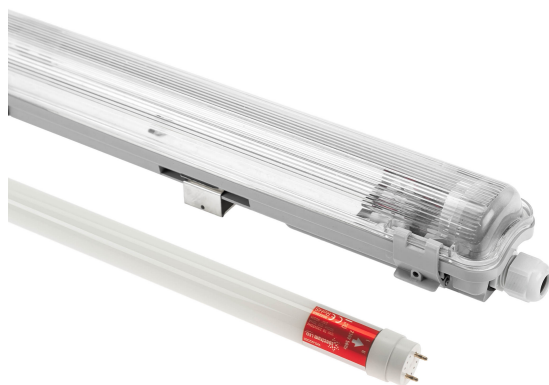
Luminaire sold without light source